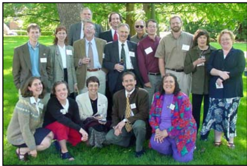
The PPPM Community (Faculty and Staff)

Each year we accept approximately 25 undergraduate majors into the PPPM program. This means that PPPM classes are small, giving students the opportunity to interact directly with professors and other students.