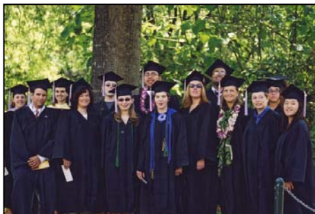
Recent graduating seniors

Fulbright-Garcia Robles Grantee , U.S.-Mexico Public Policy Initiative