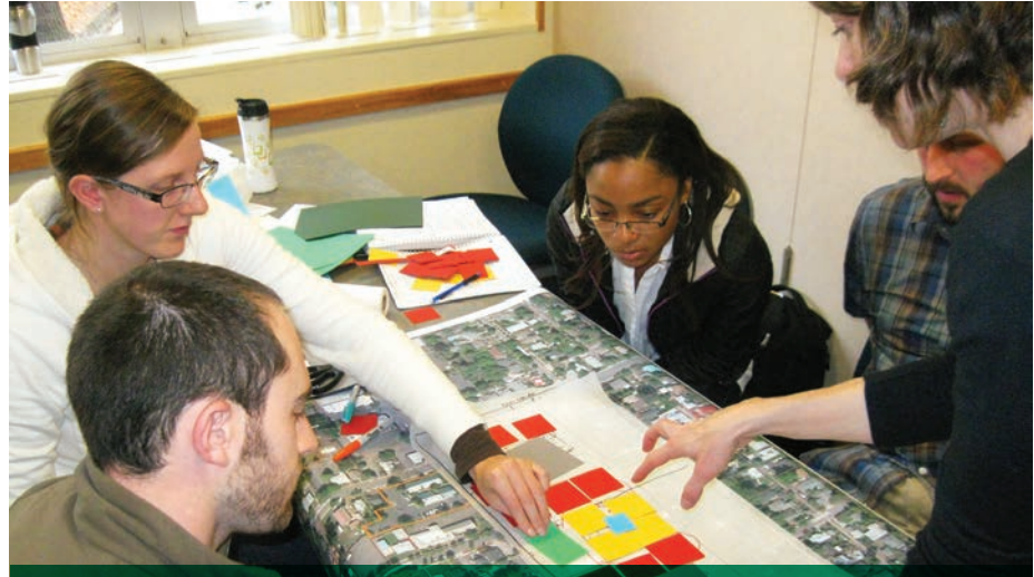
Sustainable Cities Program Year students working in Medford, Oregon with local residents and city officials to prepare a redevelopment plan for a site near downtown.

The SCYP has worked with these Oregon cities to improve how cities are built and function—Gresham, Salem, Springfield, and Medford.